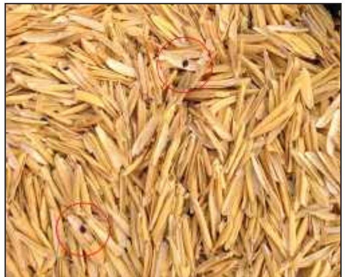
Image 3: Rice hulls make an inhospitable site for weed germination. This photo shows oxalis seed (in red circles) on the substrate surface, still unable to germinate after 6 weeks.

After observing this trial for several weeks, I was impressed with how quickly the rice hulls dried following irrigation. Since nitrogen was not limiting in these pots, I concluded that it must have been the water that was limiting. Perhaps the rice hulls dry too quickly for weed seed to successfully germinate and establish? We didn't have any sensors or fancy gadgets to measure moisture levels in the rice hulls. However, we irrigated all these pots twice daily, and we could see with our own eyes how quickly the rice hulls dried after irrigation. We could also see the weed seed and liverwort gemmae (reproductive spores) sitting on the surface of the rice hulls without ever germinating or establishing (Image 3).