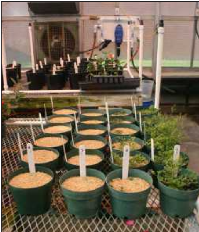
Image 2: Rice hull mulch provides excellent control of bittercress and liverwort. From left to right are covered with 1, ½, ¼, and 0 inches of parboiled rice hulls.

Rice hulls at ½ or 1 inch depth provided 100% weed control (Figure 1) (Image 2). No weeds grew in these pots. In containers with ¼ inch of rice hulls, both bittercress and liverwort grew, albeit a lot less than the un-mulched pots. This may have something to do with the way we applied the rice hulls. For the 1 inch mulch depth, we carefully weighed the containers before and after applying rice hulls to a depth of 1 inch. The weight of rice hulls in those pots was 44 g. So, for the pots receiving ½ inch of rice hulls, we simply weighed 22 g of rice hulls for each pot, and 11 g for the ¼ in pots. This seemed a fair, consistent, and accurate way to