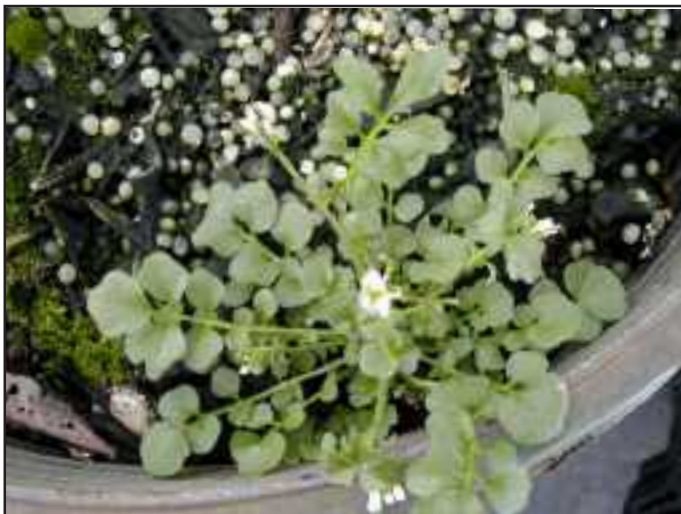
Image 1: Bittercress is especially difficult to control in propagation houses and other covered structures where herbicide use is limited.

A very promising part of this project thus far has been the use of parboiled rice hulls as a mulch in containers. Riceland Foods, Inc. has been marketing their parboiled rice hulls for weed management in horticulture crops, and some nursery producers in Ohio have already successfully used rice hulls for weed control. The goal of our research was to determine, in controlled research, what quantity of rice hulls provided effective weed control of liverwort ( Marchantia polymorpha ) and bittercress ( Cardamine flexuosa ) (Image 1).