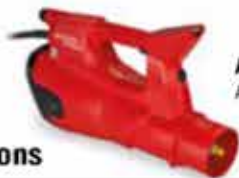
AS 1200 AC1 Art.No. 12118001