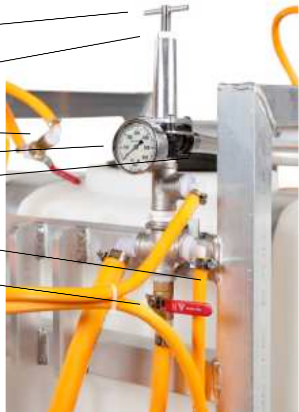
Figure 1: Detailed View