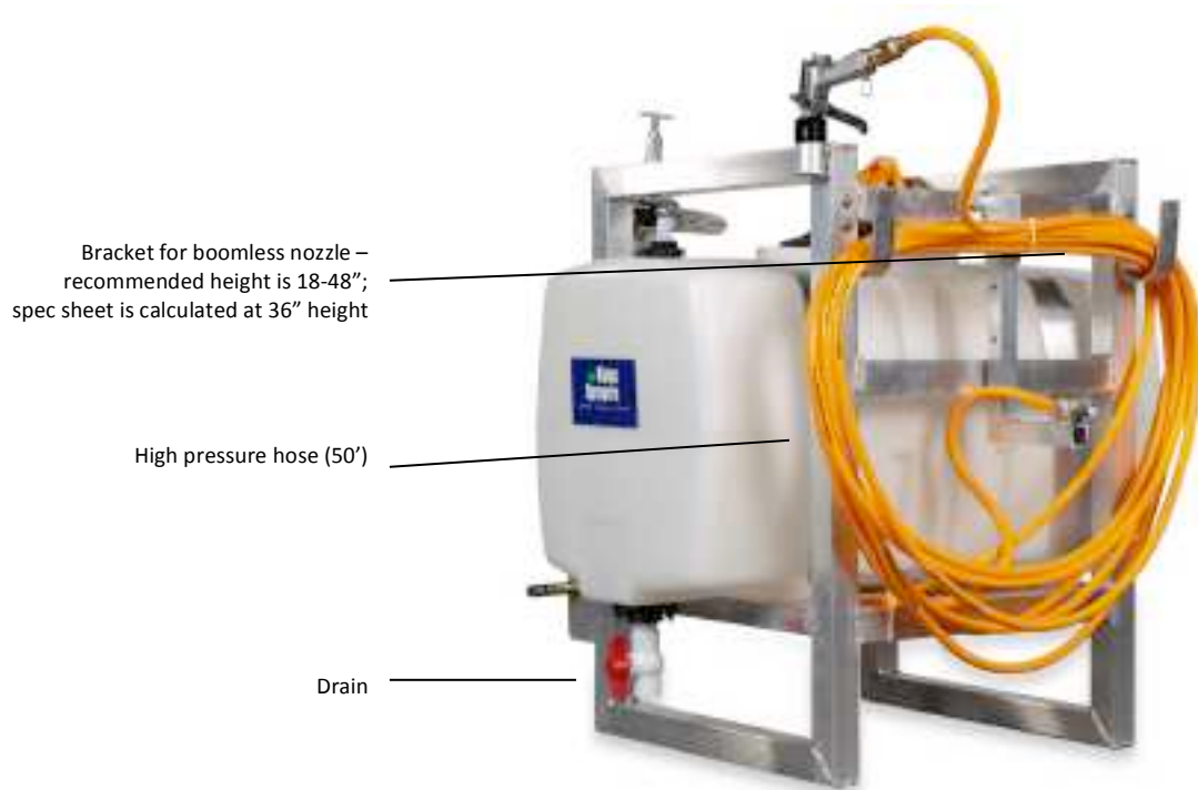
Figure 4: Back View