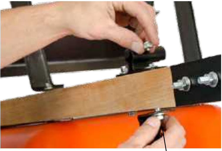
Front bolt secures both tray brace and axle bracket.

Install One Axle Bracket - Place a #WB1006 Axle Bracket into position, closed end to the outside. Insert a 2-1/2" Hex Head Bolt through the handle and rear hole. Fasten washer and nylon lock nut. Position #WB1007 Front Tray Brace over front hole, install a 2-3/4" Hex Head Bolt through the brace, handle, and axle bracket, then secure with washer and nylon lock nut.