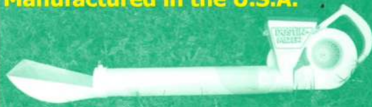
MODEL 1212 (shown) - Includes Deflector